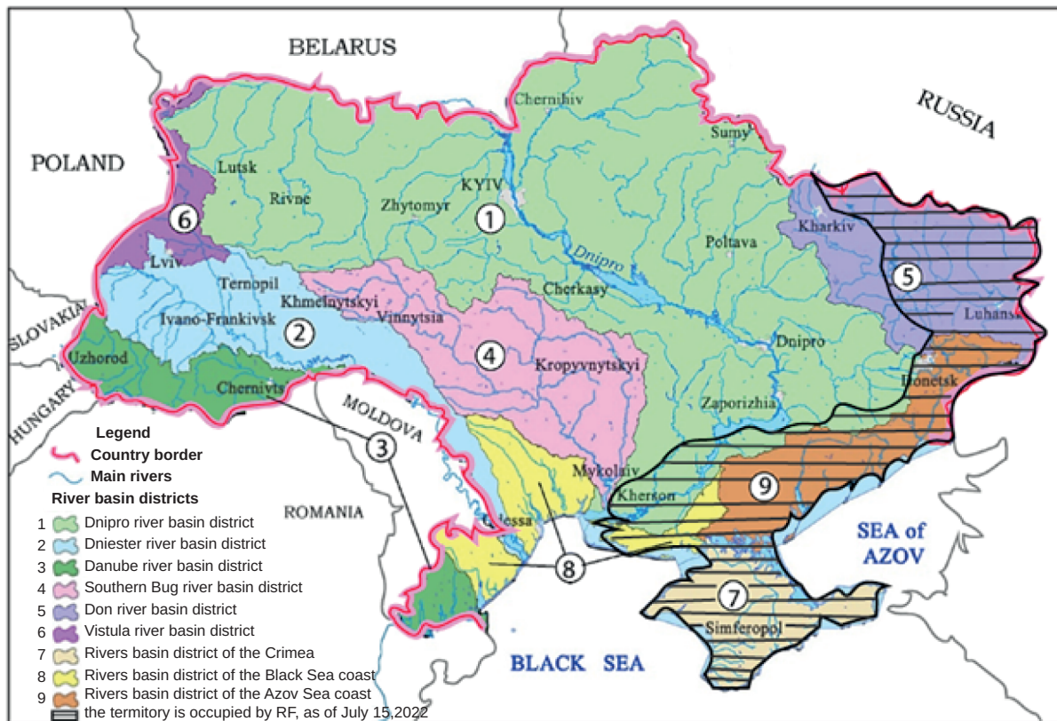
Figure 2. Map scheme of hydrographic zoning of Ukraine, on which black dashed lines indicate the territory controlled by the troops of the Russian federation as of August 1, 2022 (Khilchevskiy & Grebin, 2022)

“Unlike Mykolaiv Oblast, Khersonska is located in the dry steppe zone at the watershed of the lower Dnieper and Black Sea rivers, washed by the Black and Azov Seas, as well as the Sivash (Rotten Sea). It should be noted that the water bodies of the Kherson region occupy 430.5 thousand hectares, but the amount of water per inhabitant of the region is 15–20 times less than in other regions of Ukraine. Twenty-six rivers flow through the territory of the region, there are 693 lakes with a total area of 170.22 thousand hectares and 1154 ponds with an area of 12.3 thousand hectares. Artificial reservoirs occupy 64.28 thousand ha” (Kherson Regional Department of Water Resources, 2021). Therefore, the rivers of the southern part of the steppe are used for small irrigation of agricultural lands and for water supply, which is why in summer there is a decrease in water content, shallowing, and pollution of small rivers.