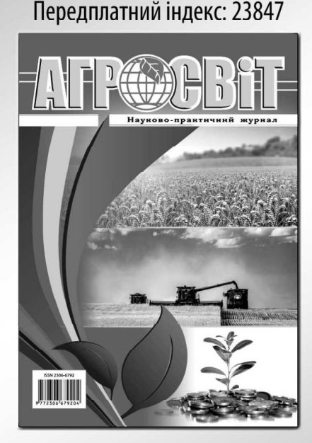
Виходить 24 рази на рік

Журнал включено до переліку наукових фахових видань України з ЕКОНОМІЧНИХ НАУК (Категорія «Б»)