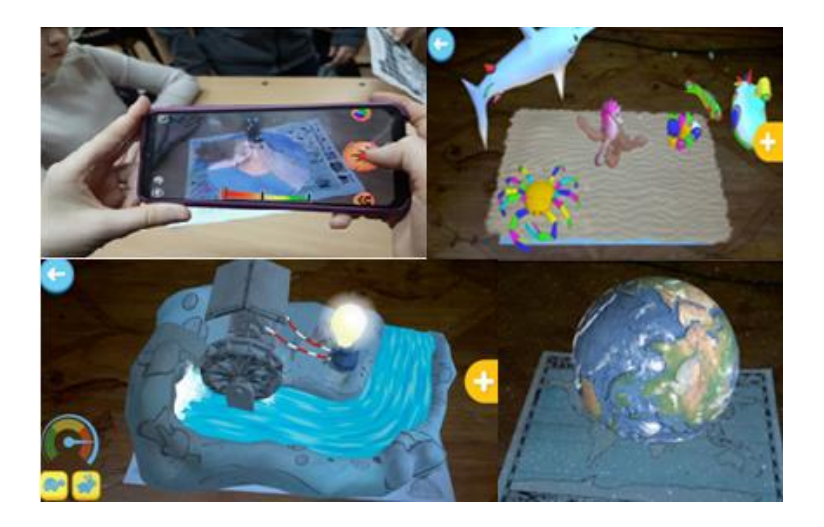
Figure 2. Examples of the usage AR- applications in a work.

The analysis of the proposed applications let make the conclusions about the possibilities of the usage of technology of the supplemented reality in education, letting that it helps visually recreate the processes which the material objects do not recreate, make the educated process more visible and interesting, increase the thirst to knowledge. The scope for the usage is wide – from the adding of the animation in textbooks and manuals for the visualization of the material to the three-dimensional studying presentations which let visually show that or another process (Fig. 2).