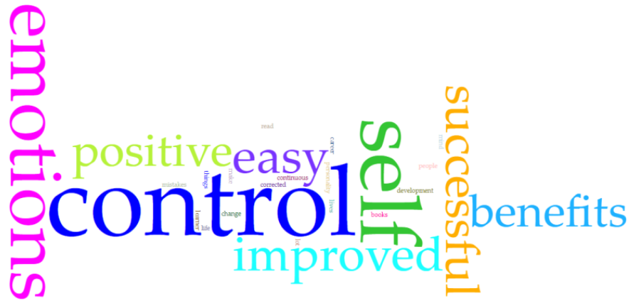
Figure 3. The content analysis of the responses provided by the focus group volunteers to the first question

Question 1. The content analysis of the responses provided by the focus group volunteers showed that the five most frequently used words to answer this question were: control, self, emotions, benefits, easy (see Figure 3).