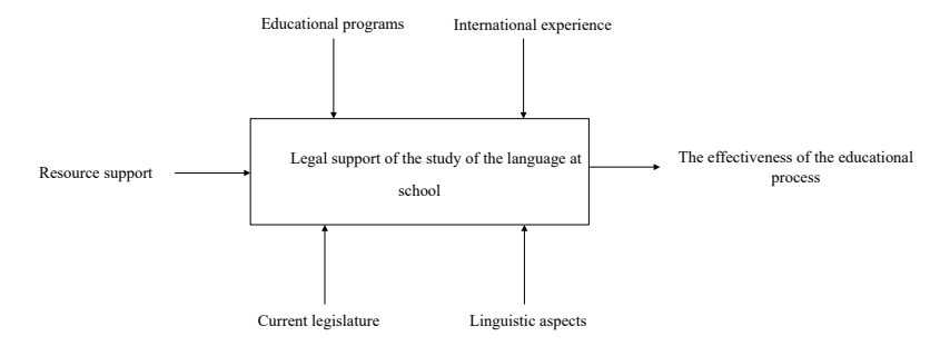
The model of legal support of the study of the language at school is presented in Fig. 2. Fig. 2. The model of legal support of the study of the language at school.