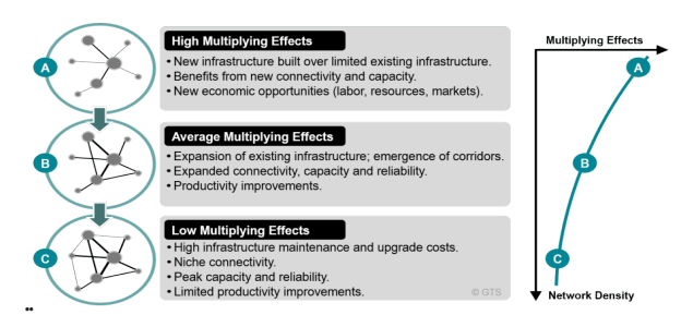
Figure 2. Interdependence of the multiplier effect of investments in the transport and logistics systems of the regions in the context of their impact on GRP

According to Figure 2, the multiplier effect of investments in the transport and logistics systems of the regions in the context of their impact on GRP is divided into high dependence, medium, and low.