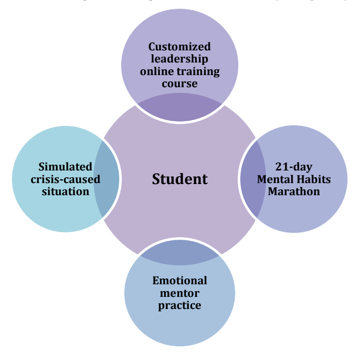
Figure 2. Simplified visualised design of the train-the-trainer leadership programme entitled "Crisis-driven Leadership"

This was designed to be a train-the-trainer leadership programme entitled "Crisis-driven Leadership". This included a beforehand created and customized leadership online training course based on the Leadership Training Programme. The students were also engaged in the "21-day Mental Habits Marathon" that was aimed to train the students' resilience skills, positive thinking, and encouraging other people (sharing enthusiasm). Each student was trained to be an emotional mentor for one of their groupmates. They were responsible for their peers' controlled behaviour in the simulated crisis-caused situation with the pressure imposed on the students (see Figure 2).